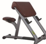
WRK-AN-13 铁椅凳 Scott Bench Size(L*W*H(mm)):1150*700*740mm Machine weight:55 kg