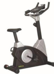
WRK-C03 立式健身车 Upright bike Size(L*W*H(mm)):1100*550*1500mm Machine weight:80kg