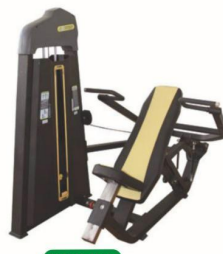
WRK-F 06 仰卧举肩 Shoulder Press Size(L*W*H(mm)):1850*1200*1320mm Machine weight:239 kg Weight stack:65 kg