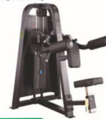
WRK-F 05 A 肩部训练器 Lateral Raise Size(L*W*H(mm)):1300*960*1370mm Machine weight:173 kg Weight stack:65 kg