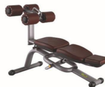
WRK-AN 07 可调式腹肌训练椅 Crunch Bench Size(L*W*H(mm)):1740*630*1040mm Machine weight:45 kg