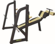
WRK-F 41 下斜举架 Olympic Decline Bench Size(L*W*H(mm)):12060*1780*1090mm Machine weight:98 kg