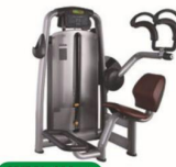
WRK-AN-30 腹部前屈训练器 Abdominal Crunch Size(L*W*H(mm)):1040*1320*1500mm Machine weight:255 kg Weight stack:95 kg