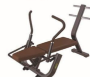
WRK-F 70 腹肌训练器 Abdominal Trainer Size(L*W*H(mm)):1600*930*1050mm Machine weight:80 kg