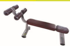
WRK-AN 57 下斜腹肌板 Web Board Size(L*W*H(mm)):1650*620*1160mm Machine weight:40 kg