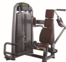
WRK-AN 05 蝴蝶机训练器 Pectoral Machine Size(L*W*H(mm)):1500*1240*1700mm Machine weight:275 kg Weight stack:100 kg