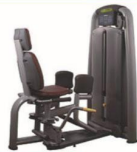
WRK-AN-10 大腿外侧肌训练器 Abductor/Outer Thigh Size(L*W*H(mm)):1430*1400*1530mm Machine weight:280 kg Weight stack:70 kg