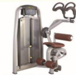
WRK-AN-22 腹部前屈训练器 Total Abdominal Size(L*W*H(mm)):1300*900*1520mm Machine weight:285 kg Weight stack:95 kg