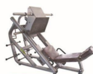
WRK-AN 56 倒置机 Leg press Size(L*W*H(mm)):1530*970*1470mm Machine weight:230kg