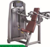
WRK-AN-26 坐式单肩训练器 Shoulder Press Size(L*W*H(mm)):1600*1500*1520mm Machine weight:270 kg Weight stack:65 kg