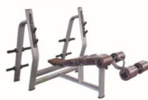
WRK-AN 44 豪华下斜推举架 Olympic Decline Bench Size(L*W*H(mm)):1650*1630*1180mm Machine weight:50 kg