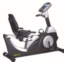
WRK-C04 卧式健身车 Recumbent bike Size(L*W*H(mm)):1500*850*1350mm Machine weight:110kg