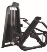
WRK-F 06 A 仰卧举肩训练器 Shoulder Press Size(L*W*H(mm)):1850*1220*1320mm Machine weight:85 kg