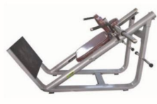
WRK-AN 55 深蹲架 Squat rack Size(L*W*H(mm)):1620*1030*1480mm Machine weight:170 kg