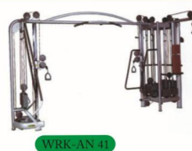
WRK-AN 41 五人站 Crossover&Cable Jungle Size(L*W*H(mm)):3000*980*2500mm Machine weight:680 kg Weight stack:330 kg