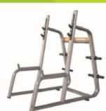
WRK-AN 50 深蹲架 Squat Rack Size(L*W*H(mm)):2300*1270*1100mm Machine weight:150 kg