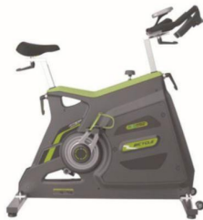
WRK-D 08 动感单车 Spinning bike Size(L*W*H(mm)):1030*580*1140mm Machine weight:70kg