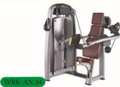
WRK-AN 34 坐式肩部训练器 Delt Machine Size(L*W*H(mm)):1200*980*1600mm Machine weight:216 kg Weight stack:95 kg