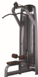
WRK-AN 04 坐姿高位背肌训练器 Lat Pulldown Size(L*W*H(mm)):1600*1150*1850mm Machine weight:335 kg Weight stack:100 kg