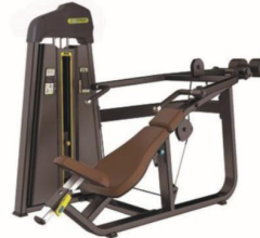
WRK-F 13 上斜推胸训练器 Incline chest press Size(L*W*H(mm)):1620*110*1030mm Machine weight:223 kg Weight stack:65 kg