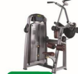
WRK-AN-27 低位坐式下拉训练器 Pull Down Size(L*W*H(mm)):1300*800*1870mm Machine weight:300 kg Weight stack:95 kg