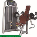
WRK-AN-25 二头肌训练器 Arm Curl Size(L*W*H(mm)):1500*960*1520mm Machine weight:260 kg Weight stack:65 kg