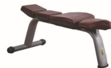
WRK-AN 08 平凳 Flat Bench Size(L*W*H(mm)):1460*650*440mm Machine weight:35 kg