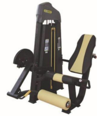
WRK-F 02 坐姿伸腿 Leg Extension Size(L*W*H(mm)):1300*990*1350mm Machine weight:223 kg Weight stack:95 kg