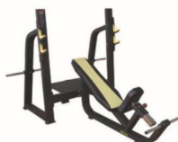
WRK-F 43 上斜举架 Olympic Bench Incline Size(L*W*H(mm)):2060*1350*1600mm Machine weight:215 kg