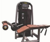
WRK-AN 37 卧式曲腿训练器 Phone Leg Curl Size(L*W*H(mm)):1550*1480*1600mm Machine weight:230 kg Weight stack:95 kg