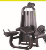
WRK-F 01 A 俯卧曲腿训练器 Prone Leg Curl Size(L*W*H(mm)):1520*990*1330mm Machine weight:216 kg Weight stack:95 kg