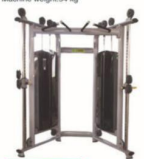
WRK-AN 54 小飞鸟 Multi-Function Trainer/FTS Glide Size(L*W*H(mm)):2400*1400*2200mm Machine weight:350 kg Weight stack:70 kg*2