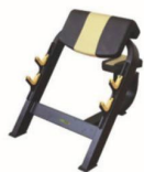
WRK-F 44 扶膝椅 Seated Preacher Curl Size(L*W*H(mm)):1320*840*970mm Machine weight:55 kg