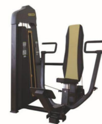
WRK-F 08 立式推胸 Vertical Press Size(L*W*H(mm)):1320*1300*1350mm Machine weight:214 kg Weight stack:100 kg