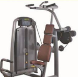
WRK-AN-21 坐式下拉训练器 Vertical Traction Size(L*W*H(mm)):1250*1300*1870mm Machine weight:300 kg Weight stack:95 kg