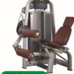
WRK-AN-24 坐式曲腿训练器 Seated Leg Curl Size(L*W*H(mm)):1550*1480*1600mm Machine weight:255 kg Weight stack:95 kg