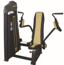
WRK-F 04 蝴蝶夹胸训练器 Butterfly Size(L*W*H(mm)):1480*860*1620mm Machine weight:223 kg Weight stack:100 kg