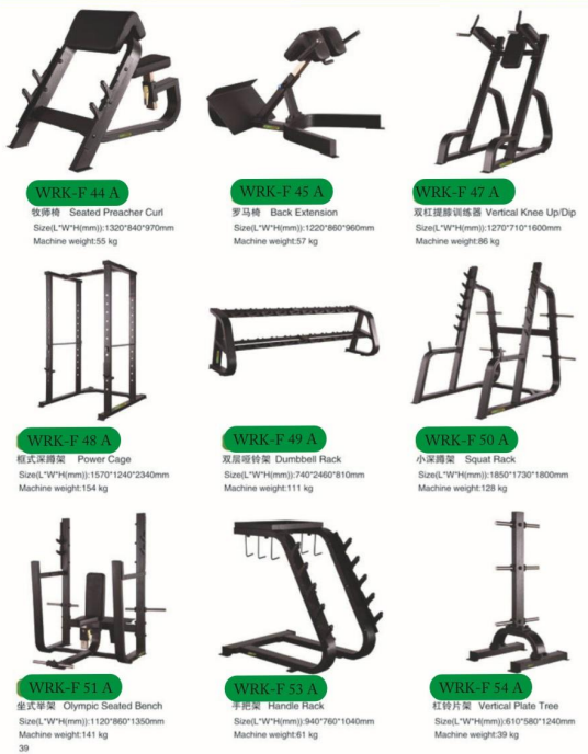
WRK-F 44 A

牧师椅 Seated Preacher Curl Size(L*W*H(mm)):1320*840*970mm Machine weight:55 kg