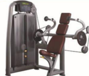
WRK-AN-15 三头肌训练器 Arm Extension Size(L*W*H(mm)):1500*960*1530mm Machine weight:260 kg Weight stack:70 kg