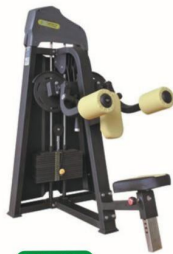
WRK-F 05 肩部训练器 Lateral Raise Size(L*W*H(mm)):1300*860*1370mm Machine weight:173 kg Weight stack:65 kg