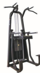
WRK-F 07 单双杠训练器 Dip Chin Assist Size(L*W*H(mm)):1550*1370*2360mm Machine weight:289 kg Weight stack:150 kg