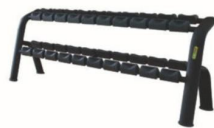
WRK-AN 02 短铃架 Dumbbell Rack Size(L*W*H(mm)):2360*840*850mm Machine weight:150 kg