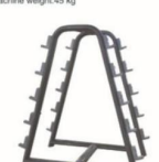
WRK-AN 61 十支装杠铃架 Barbell rack for 10pcs Size(L*W*H(mm)):1485*870*970mm Machine weight:65 kg