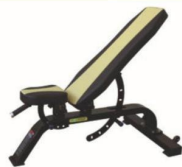
WRK-F 39 可调式哑铃练习凳 Super Bench Size(L*W*H(mm)):1620*760*810mm Machine weight:61 kg