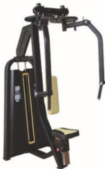
WRK-F 07 反飞鸟 Pearl Delt/Pec Fly Size(L*W*H(mm)):1240*990*2110mm Machine weight:65 kg