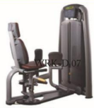
WRK-AN-09 大腿内侧肌训练器 Adductor/Inner Thigh Size(L*W*H(mm)):1430*1400*1530mm Machine weight:280 kg Weight stack:70 kg