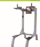
WRK-AN 58 双杠提膝 Vertical Knees Up Dip Size(L*W*H(mm)):1400*800*1600mm Machine weight:55 kg