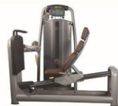
WRK-AN-16 坐式蹬腿训练器 Leg Press Size(L*W*H(mm)):1760*1060*1530mm Machine weight:445 kg Weight stack:100kg