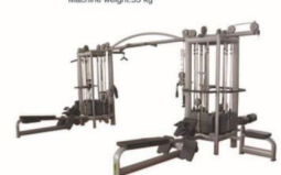
WRK-AN 60 八人站 8 stations Size(L*W*H(mm)):6500*3460*2310mm Machine weight:1100 kg Weight stack:425 kg