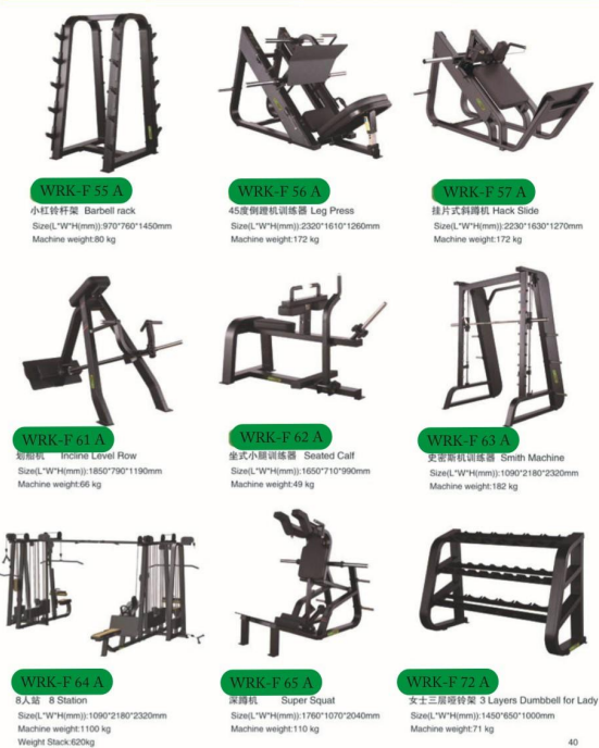
WRK-F 55 A

杠铃片架 Vertical Plate Tree Size(L*W*H(mm)):610*580*1240mm Machine weight:39 kg