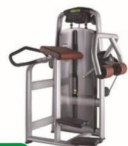
WRK-AN 36 后抬腿训练器 Glute Isolator Size(L*W*H(mm)):1860*1100*2300mm Machine weight:219 kg Weight stack:70 kg