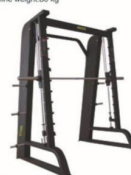
WRK-F 63 史密斯机 Smith Machine Size(L*W*H(mm)):1090*2180*2320mm Machine weight:182 kg