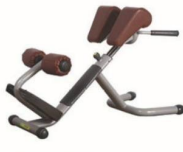
WRK-AN-31 罗马椅 Roman Chair Size(L*W*H(mm)):2240*1400*760mm Machine weight:22 kg