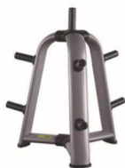
WRK-AN 01 杠铃片架 Plate Tree Size(L*W*H(mm)):780*780*1100mm Machine weight:31 kg