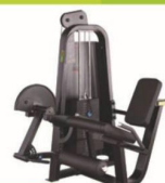
WRK-F 02 A 坐姿伸腿训练器 Leg Extension Size(L*W*H(mm)):1300*990*1350mm Machine weight:223kg Weight stack:35 kg