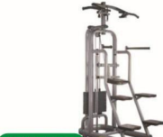
WRK-AN-25 助力单双杠训练器 Assisted Chin Up/Dip Size(L*W*H(mm)):1080*1100*2380mm Machine weight:350 kg Weight stack:150 kg