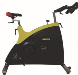
WRK-D 07 动感单车 Spinning bike Size(L*W*H(mm)):1030*1580*1140mm Machine weight:68 kg