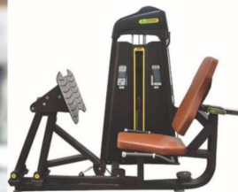
WRK-F 03 坐姿蹬腿训练器 Leg Press Size(L*W*H(mm)):1620*110*1030mm Machine weight:223 kg Weight stack:145 kg