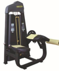
WRK-F 01 俯卧曲腿 Prone Leg Curl Size(L*W*H(mm)):1300*990*1350mm Machine weight:216 kg Weight stack:95 kg