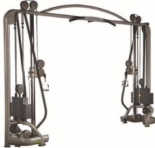
WRK-AN-14 大飞鸟训练器 Cable Crossover Size(L*W*H(mm)):3700*890*2250mm Machine weight:485 kg Weight stack:55 kgs*2