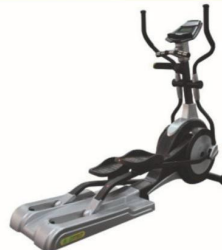
WRK-C05 椭圆机 Elliptical machine Size(L*W*H(mm)):2100*500*1650mm Machine weight:150kg