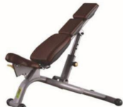
WRK-AN-12 可调式可升降练习凳 Adjustable Bench Size(L*W*H(mm)):1150*600*800mm Machine weight:35 kg