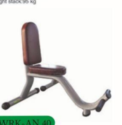
WRK-AN 40 推肩椅 Utility Bench Size(L*W*H(mm)):1000*720*1320mm Machine weight:30 kg