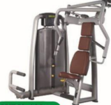
WRK-AN-20 坐式双向推胸训练器 Seated Chest Press Size(L*W*H(mm)):1530*1500*1640mm Machine weight:290 kg Weight stack:100 kg