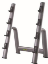
WRK-AN 03 杠铃架 Barbell Rack Size(L*W*H(mm)):1130*700*850mm Machine weight:90 kg