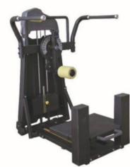
WRK-F 11 摆腿训练器 Multi Hip Size(L*W*H(mm)):1310*1150*1650mm Machine weight:239 kg Weight stack:100 kg