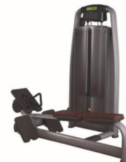
WRK-AN 06 低拉背/坐姿划船训练器 Long Pull Size(L*W*H(mm)):1950*1050*1800mm Machine weight:380 kg Weight stack:100 kg