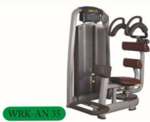
WRK-AN 35 坐式拉提训练器 Rotary Torso Size(L*W*H(mm)):1020*1000*1500mm Machine weight:270 kg Weight stack:65 kg