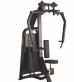
WRK-F 07 A 反飞鸟训练器 Pearl Delt Pec Fly Size(L*W*H(mm)):1240*940*2110mm Machine weight:65 kg