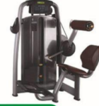
WRK-AN-19 腰部后压训练器 Back Extension Size(L*W*H(mm)):1200*960*1600mm Machine weight:255 kg Weight stack:65 kg