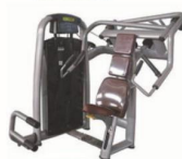
WRK-AN 47 坐式上斜推胸训练器 Incline chest press Size(L*W*H(mm)):1530*1430*1500mm Machine weight:246 kg Weight stack:100 kg