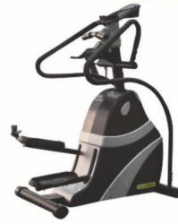
WRK-C01 登山机 Stepper Size(L*W*H(mm)):1250*900*1600mm Machine weight:90kg