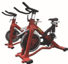
WRK-D 01 动感单车 Spinning bike Size(L*W*H(mm)):1120*500*1120mm Machine weight:60kg