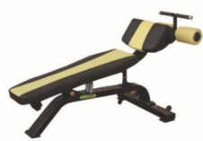
WRK-F 37 可调式腹肌板 Adjustable Decline Bench Size(L*W*H(mm)):1620*760*810mm Machine weight:61 kg