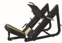
WRK-F 56 45度倒压机 Leg Press Size(L*W*H(mm)):2320*1610*1260mm Machine weight:172kg