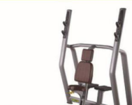
WRK-AN-24 坐式单架 Vertical Bench Size(L*W*H(mm)):1290*1630*940mm Machine weight:74 kg