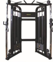
WRK-F 17 双臂机 FTS Glide Size(L*W*H(mm)):1650*1760*2250mm Machine weight:398 kg Weight stack:55 kgs*2