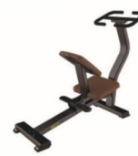
WRK-F 71 A 伸展器 Stretch trainer Size(L*W*H(mm)):1120*860*1350mm Machine weight:65 kg