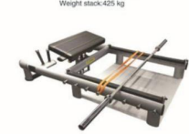
WRK-AN 65 臀部轰炸机 Hip machines Size(L*W*H(mm)):1930*1190*420mm Machine weight:130 kg