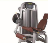
WRK-AN-23 坐式伸腿训练器 Seated Leg Extension Size(L*W*H(mm)):1200*1080*1530mm Machine weight:255 kg Weight stack:95 kg